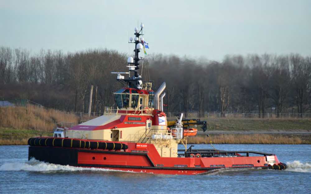
AQUA GLACIES Sweden