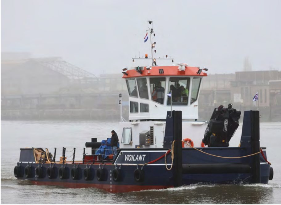
VIGILANT The Netherlands