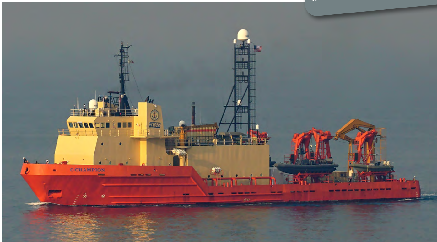
G-CHAMPION United States

Worldwide Tug & OSV News can also be found on www.tugezine.com , www.towingline.com – Archive and www.sleepduwvaart.nl