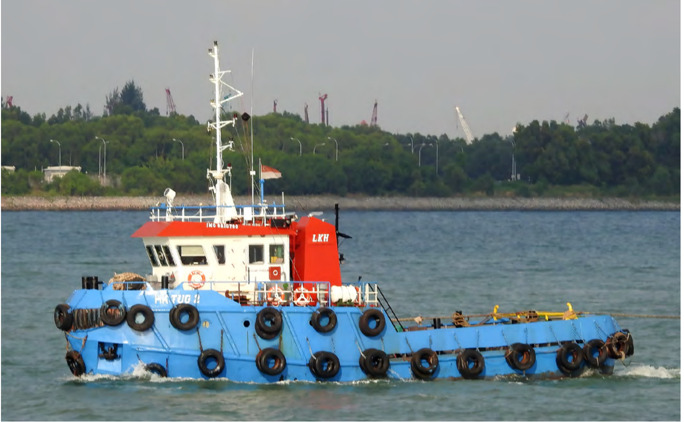
HK TUG 2 Singapore