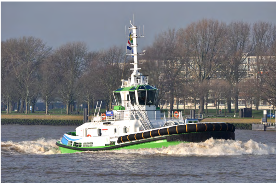
AQUA POLLUX The Netherlands

Tug Aqua Pollux (2024 – 9985150). RSD-E 2513 design. Yard: Damen Shipyards, Song Cam (VNM) ynr. 514003. 353 GT. Dim. 24,73 x 13,13 x 4,95 mtr. Engines: all electric. Bollardpull: 70 tonnes. Speed: 12 kn. Owner: Damen Green Towing Charter 1, operator: Damen Trading & Chartering B.V., Gorinchem. Tug Vigilant (2024 – ENI 27.40546). Yard: Groeneveldt Marine Construction, H.I. Ambacht. Dim. 19,95 x 8,00 x 2,75 mtr. Engines: 2x Volvo Penta, D13MH. Output: 800 bhp. Owner and operator: Sleepbedrijf Bootsma, Makkum.