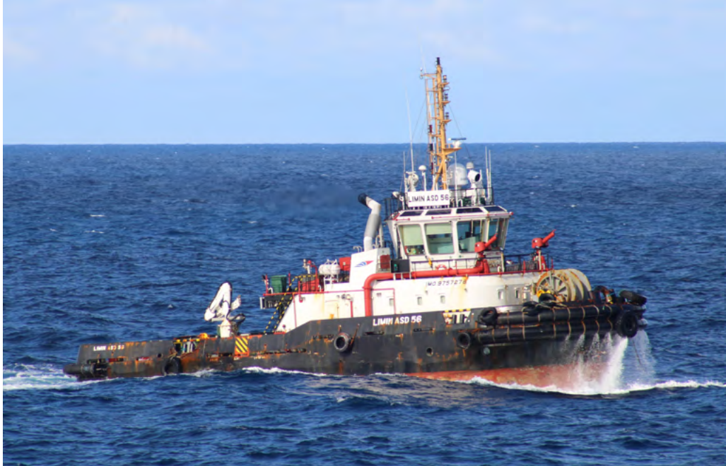
LIMIN ASD 56 Indonesia

Tug lide Maru (2007 – 9472311) owned by Far East Towing Co. Ltd., operated by Fujushima Kisen KK has been sold in 2024