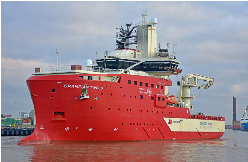
GRAMPIAN TWEED United Kingdom