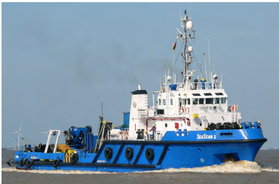
SEA SCAN / Ukrain

Tug ER 144 (2024 – 1026226). MED-A2360 design. Yard: Eregli Shipyard, ynr. 144. 340 GT. Dim. 23,40 x 10,90 x 5,75 mtr. Bollardpull: 65 tonnes, speed: 11,6 kn. Owner and operator: Med Marine Kilavuzluk, Istanbul. Tugs Kurtarma-19 (2024 – 9995129) and Kurtarma-20 (2024 – 9995117). Ramparts 2400 SX MK II design. Yard: Sanmar Denizcilik Makina ve Ticaret, ynr. resp. 349 and 348. 328 GT. Dim. 24,40 x 11,25 x 5,45 mtr. Engines: 2x Caterpillar, 3516-E. Output: 5.982 bhp.