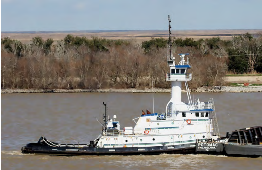
TARPON United States

If you would like to receive old editions,