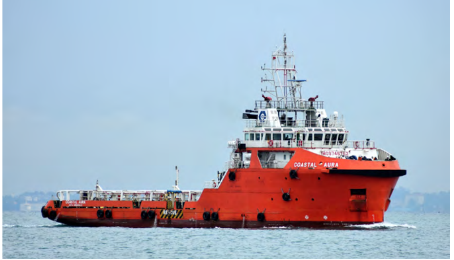
COASTAL AURA Malaysia

Tug Berry C , ex Roseberry Cross '24 (1989 –