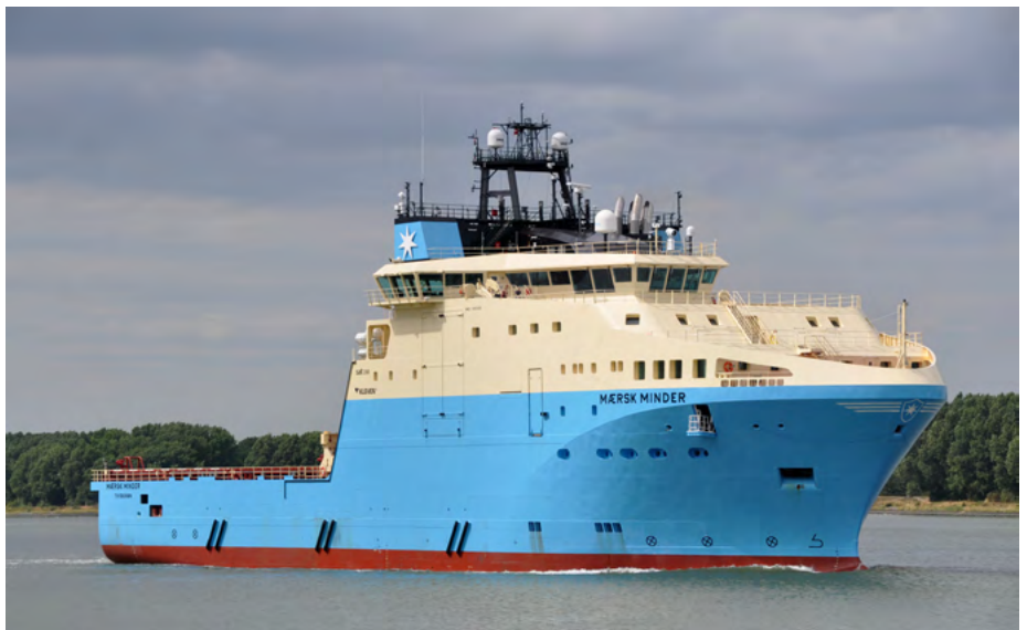
MAERSK MINDER Denmark

Tug Othello (1966 – 6613433) owned and operated by Ledra Ena Shipping Cy Ltd. has been sold in 2024 to new owner and operator E&Q STS Operations MT Ltd., Limassol and has been renamed Evros T .