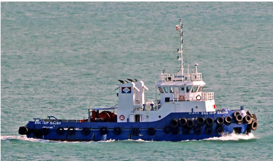
ENG HUP GAJAH Singapore