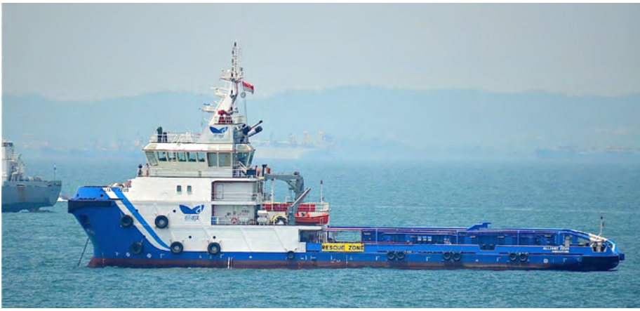
ALLIANZ ZEUS Emirates