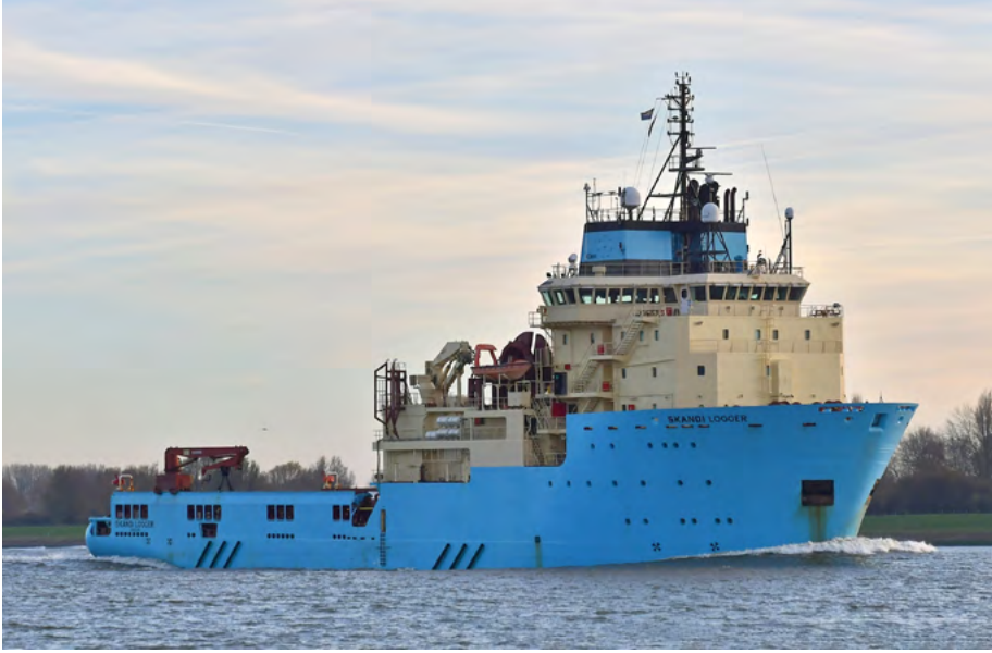
SKANDI LOGGER Denmark