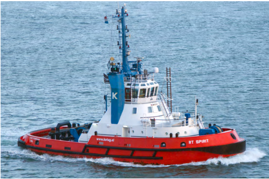
RT SPIRIT Gabon