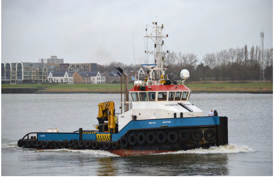
NEPTUN MASTER United Kingdom

Seacor Marine has ordered two platform supply vessels at China's Fujian Mawei Shipbuilding for delivery in the fourth quarter of 2026 and the first quarter of 2027. In addition, Seacor revealed it is selling