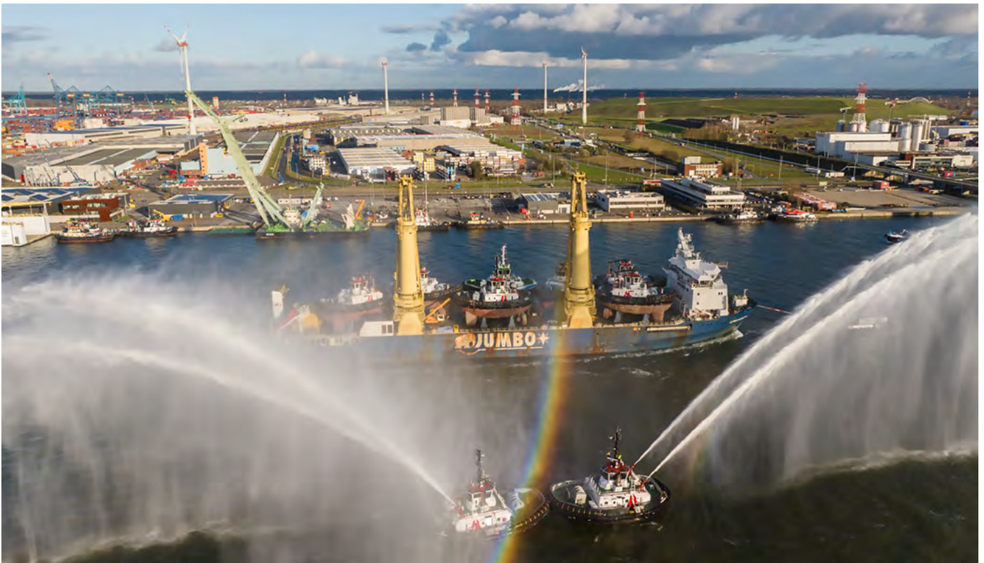
JUMBO KINETIC with newbuildings Belgium

Tug Volta 1 (2024 – 9985162). RSD-E 2513 design. Yard: Damen Shipyards, Song Cam (VNM), ynr. 514004. 353 GT. Dim.