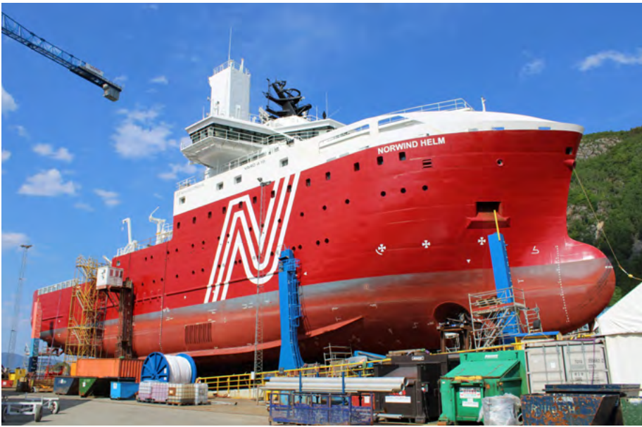
NORWIND HELM Norway