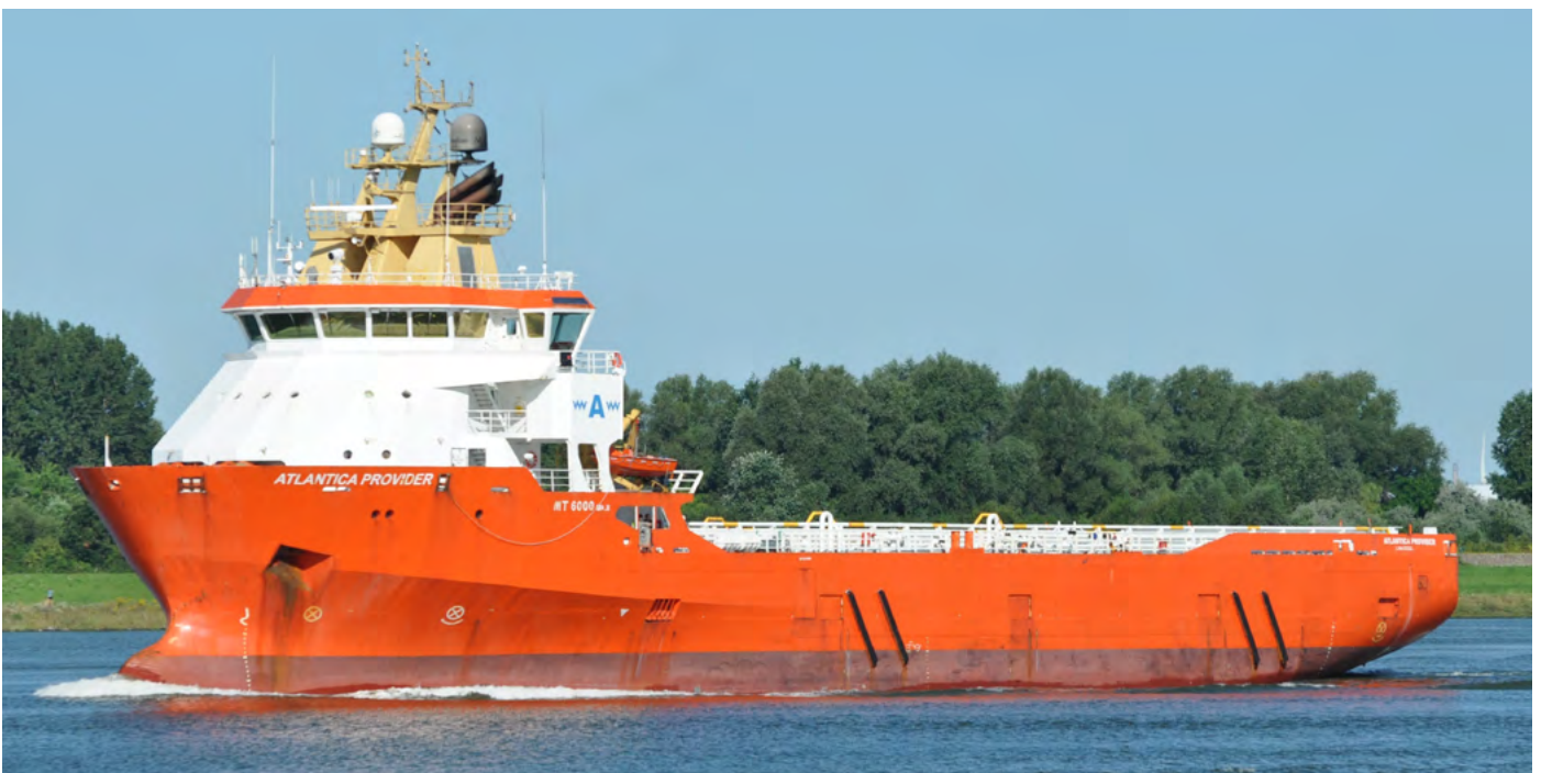
ATLANTICA TRADER Norway

CSOV Norwind Helm (2024 – 9972660). VARD 4 19 design. Yard: VARD Brattvaag,