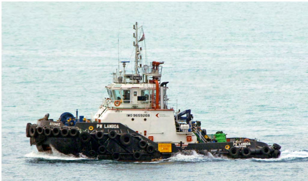
PW LAMBDA Singapore

OSV Britoil Defiance (2024 – 9761188). Yard: