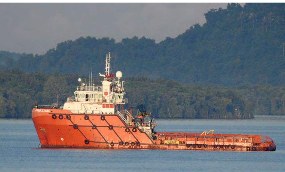
EFOGEN ALTAMIS Malaysia