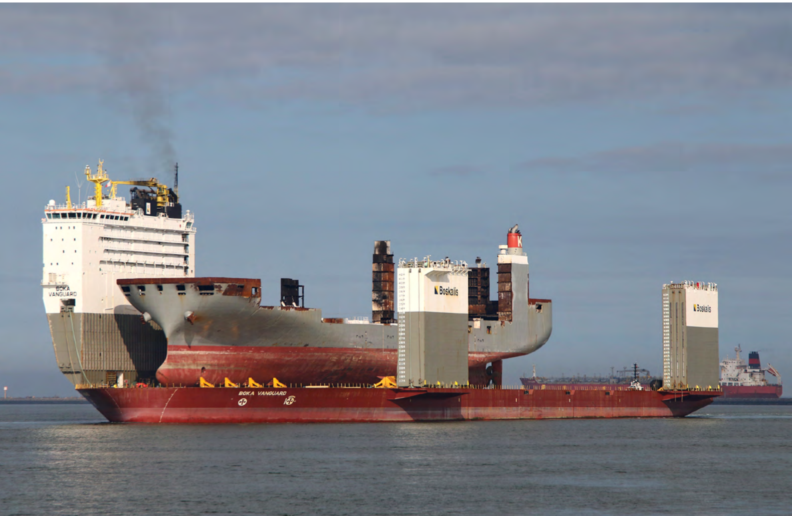
BOKA VANGUARD left Rotterdam end October with the remains of carcarrier FREMANTLE HIGHWAY (now named FLOOR) for a long trip to a shipyard in China

The editors regrets that the e-magazine is unable to supply photographs published in Worldwide Tug & OSV News.