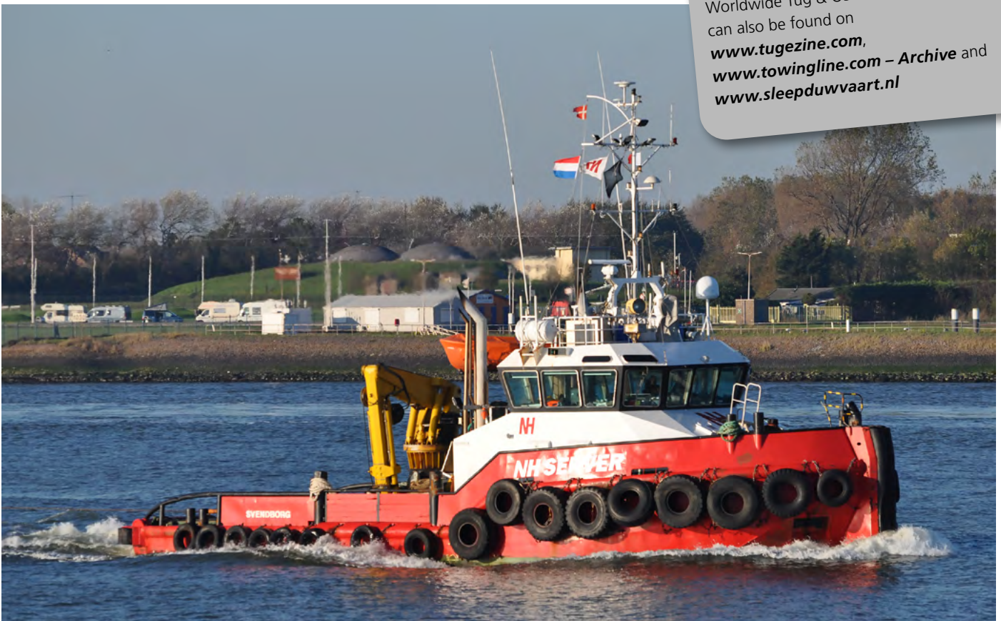
NH SERVER (Corrections)

Worldwide Tug & OSV News can also be found on www.tugezine.com , www.towingline.com – Archive and www.sleepduwvaart.nl