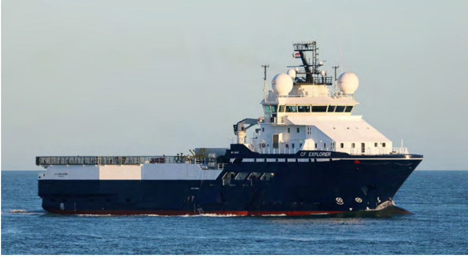
CF EXPLORER Estonia