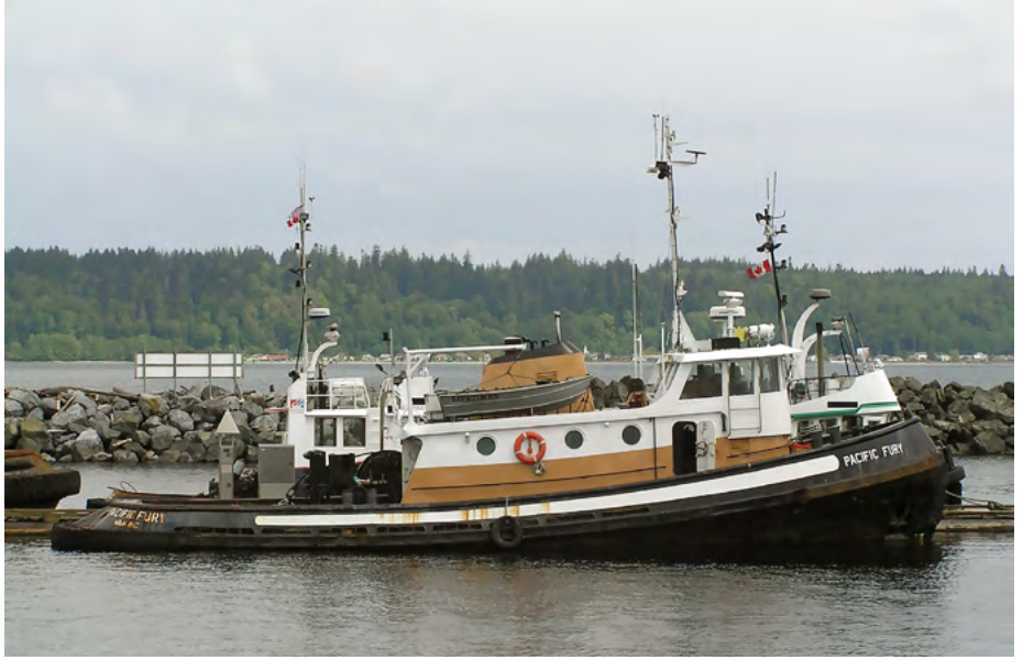
PACIFIC FURY Canada

Tugs Yick Tug 106 (2024 – 1056068) and Yick Tug 107 (2024 – 1056070). Yard: Jiangsu Zhenjiang Shipyard Group, ynr. VZJ6502-2301 and VZJ6502-2302. 521 GT. Dim. 32,20 x 10,80 x 4,35 mtr. No further