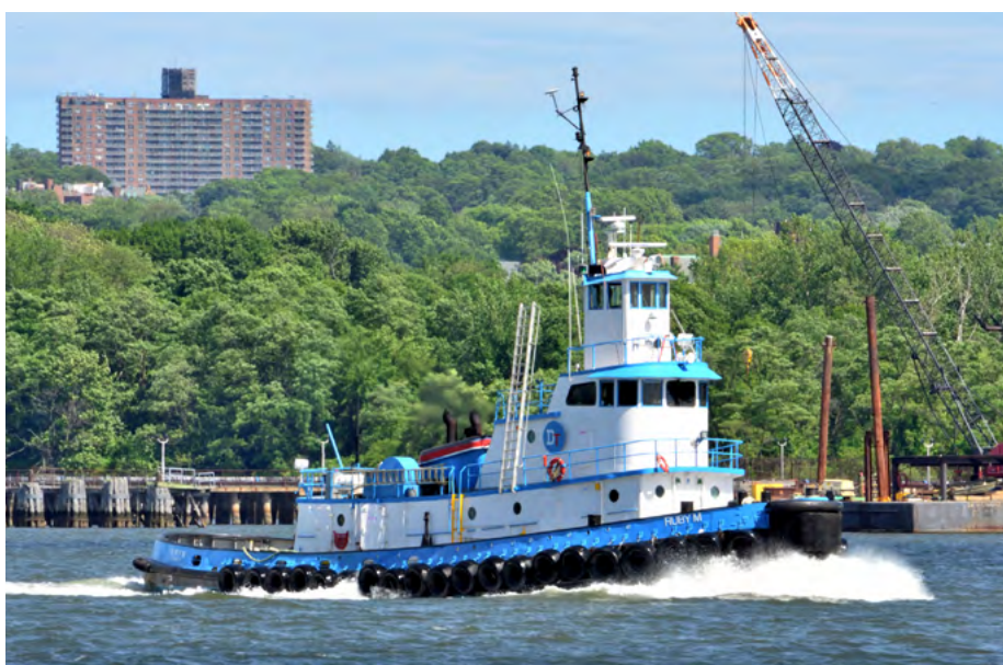
RUBY M United States

The new name of Ureka XIII , ex Smit Rusland '12, Rusland '12 (1979 – 7800497) is Reka XIII and not Reka III .