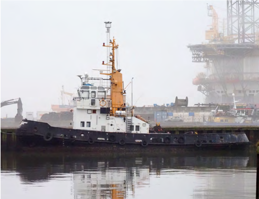
ONKEL OLE Germany