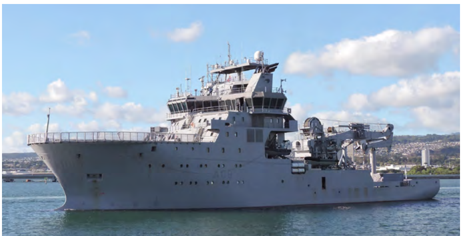
HMZNS MANAWANUI New Zealand

OSV Paragon Sentinel (2024 – 9809813). Yard: Jiangmen Hangtong Shipbuilding Co.