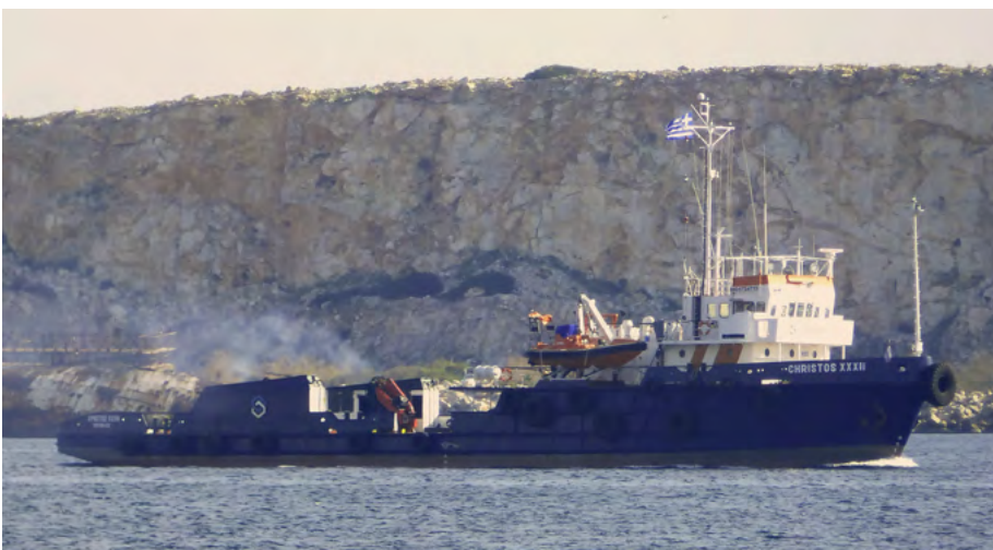
CHRISTOS XXXII Greece

Tugs Segara Sejati 5 (2012 – 8679053) and Segara Sejati 6 (2012 – 8680002) both owned and operated by Mitra Bahtera