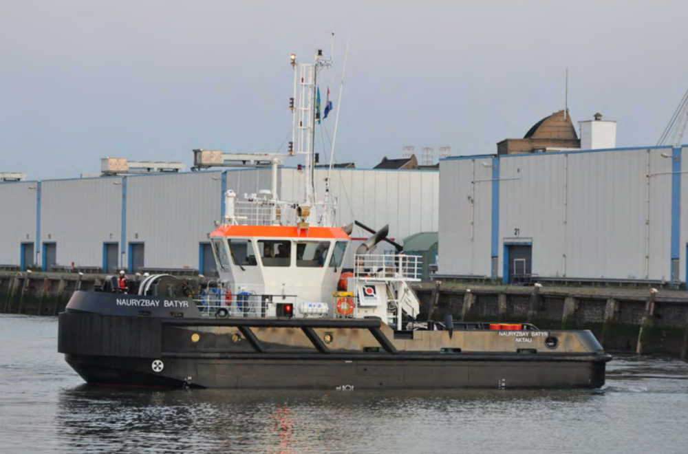
NAURIZBAY BATYR Kazakhstan