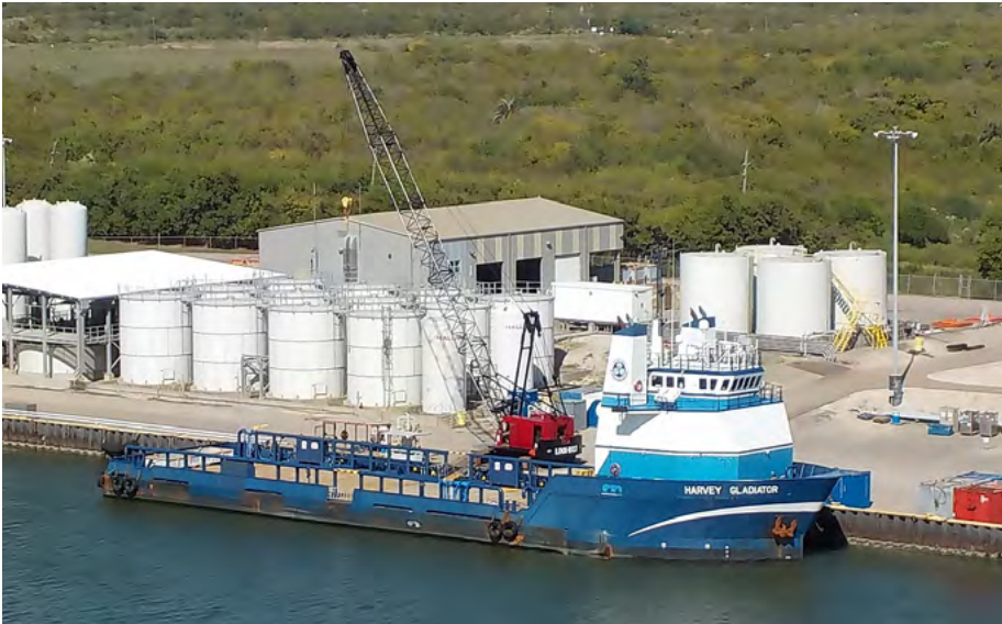
HARVEY GLADIATOR Mexico

Tugs ASC Stable (2024 – 1033157) and ASC Steady (2024 – 1033169). Yard: Fujian New Shenghai Ship Co. Ltd., Longhai (CHN), ynr. NSS2301 and NSS2302. 425 GT. Dim. 33,63 x 10,20 x 4,70 mtr. Engines: 2x Zichai