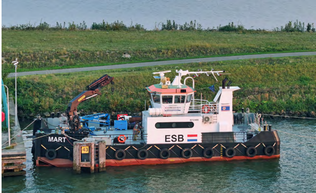
MART The Netherlands

OSV Pioneer , ex Jaya Pioneer '13, les Pioneer '16 (2011 – 9594169) owned and operated by Ftai Pioneer Singapore Pte. Ltd. has been sold in 2024 to Boskalis (NLD) and has been