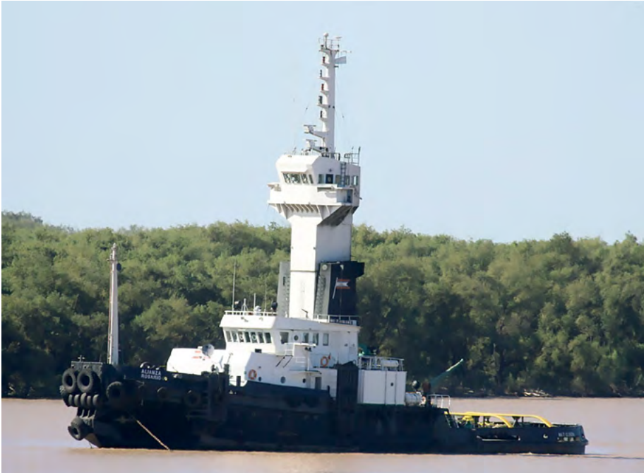
ALIANZA ROSARIO Argentina

Listed below are new constructions, renamings, sales, demolitions of tugs, anchorhandlers and offshore supply vessels that recently have taken place.