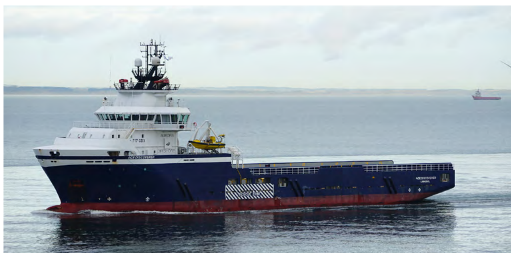
ACE DISCOVERER Norway

resp. Kased Khair T4 and Kased Khair T3 . Tug Bosung T No. 7 , ex Mai '07 (1993 – 8870176) owned and operated by Bosung Marine Transporter has been sold in 2021 to undisclosed interest and has been renamed Gwang 203 . Tug Chung Yong 107 (1994 – 8876053) owned and operated by Korea Marine Environment Management has been sold in 2024 to new owner Shinansujung Co. Ltd., Suncheon and has been renamed Samheung . Tug Polaris 11 , ex Haeyang No. 1 '10 , Kook Yang No. 1 '22 (1996 – 9151694) owned and operated by Kookyang Shipping Co. Ltd. has been sold in 2022 to new owner and operator Polaris Commercial Brokers Co., Dubai (ARE) and has been renamed Tenerife 15 .