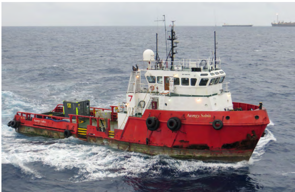
ACERGY SABIA Brazil

OSV Kenny Tide , ex Hellespont Dione '10