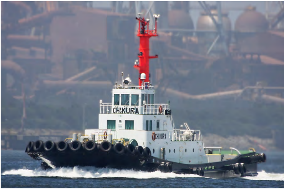
CHIKURA MARU Japan