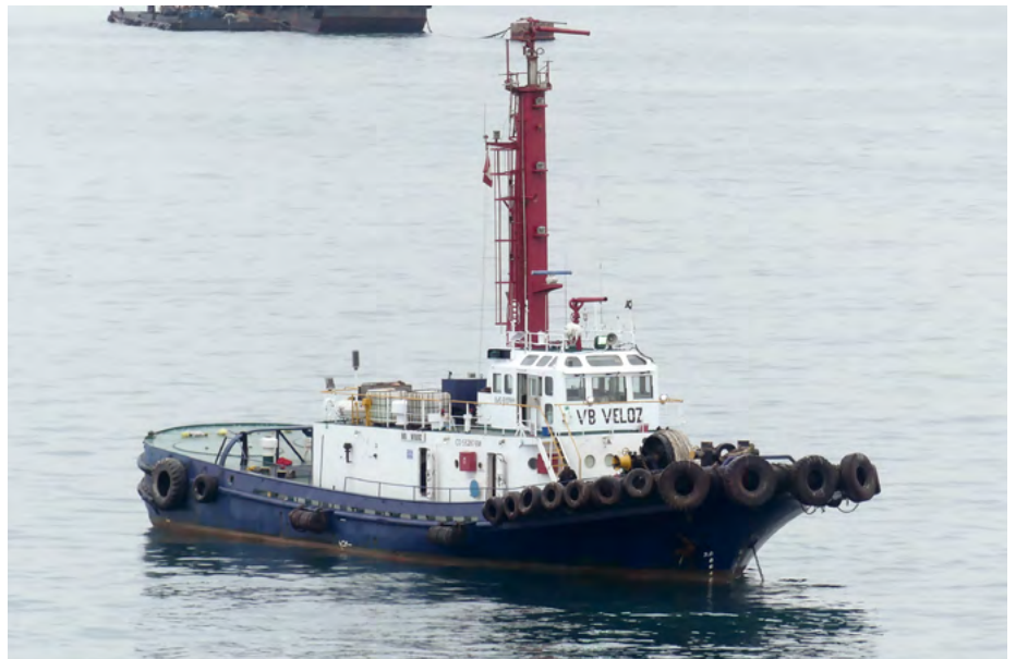
VB VELOZ Panama

AHTS ASL Cheel , ex JMH 6024 '16 (2016 – 9746463) owned and operated by Mark Marine & Investment has been sold in 2024 to new owner Al Gafai Marine Services Co., operated by Adnoc Logistics & Services, Abu Dhabi and has been renamed Adnoc A07 . Tug Capella 1 , ex Benua Antar Nusa I '85 ,