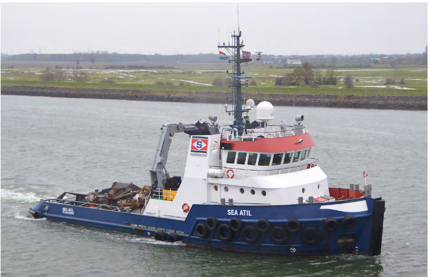
SEA ATIL The Netherlands