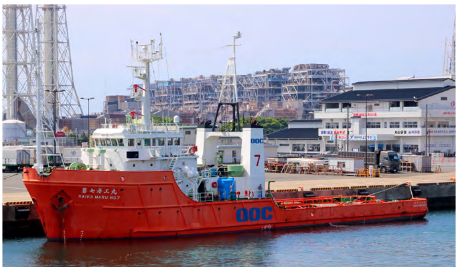
KAIKO MARU NO. 7 China

OSV Poseidon Express , ex Antenor '19 (2004 – 9285524) owned by Rederiaktieselskabet af 2019, operated by Hove Offshore Solutions AS has been sold in 2024 to new owner and operator TSH Investment 1 Ltd., Majuro (MHL) and has been renamed Poseidon 223 .