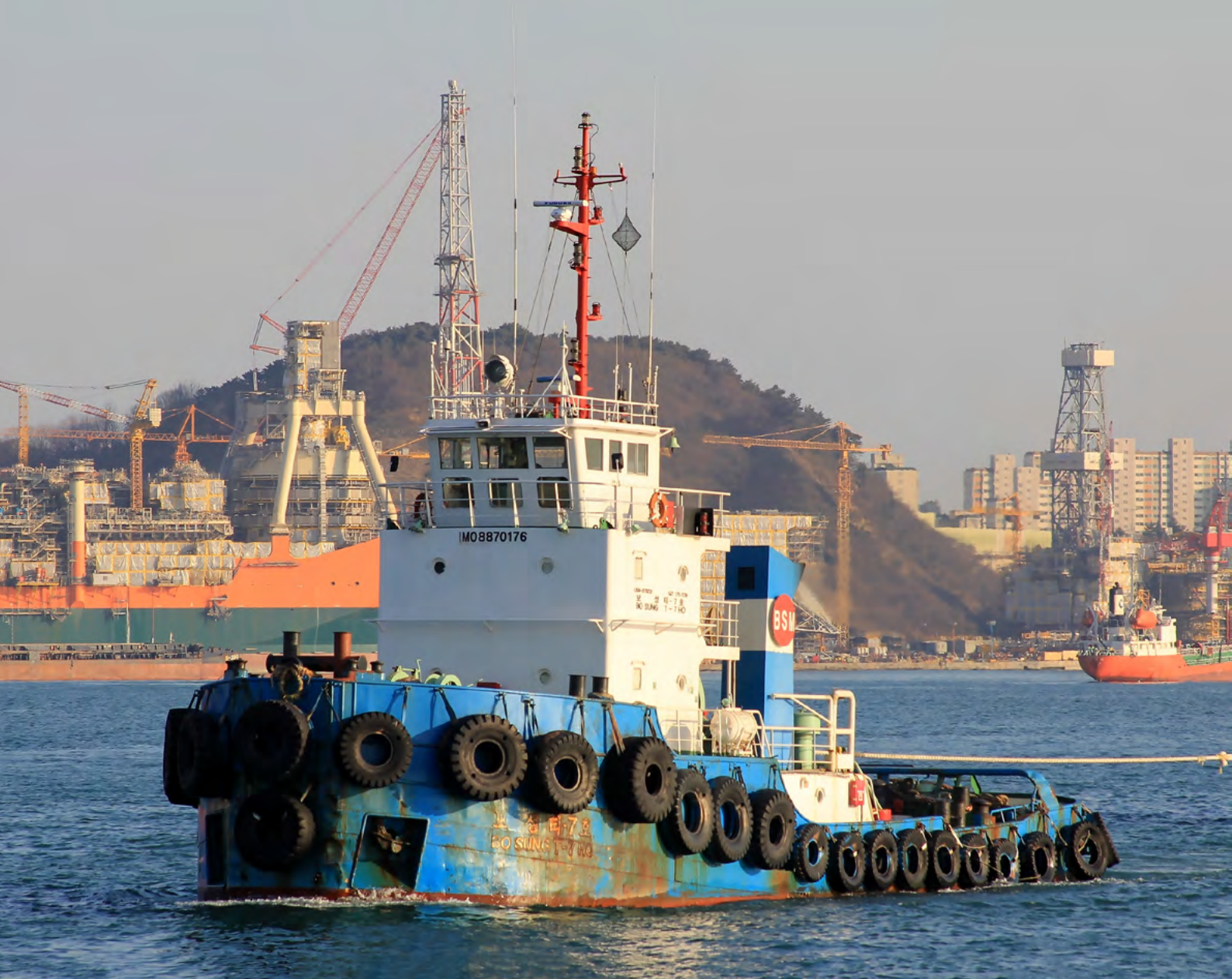
BOSUNG T NO. 7 South Korea