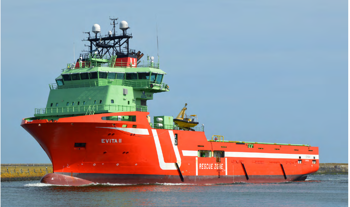
EVITA II Norway