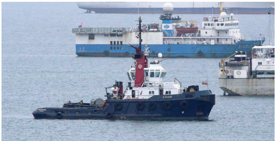
VB GLADIADOR Uruguay

The new names of OSV UP Coral (2013 – 9667239), UP Opal (2014 – 9655494) and UP Pearl (2013 – 9466099) which have been sold in 2021 by UP Offshore Apoio Maritimo to OceanPact Servicos Maritimos, Rio de Janeiro are resp. Parcel das Feiticeiras , Ilha do Mosqueiro and Parcel do Badojo .