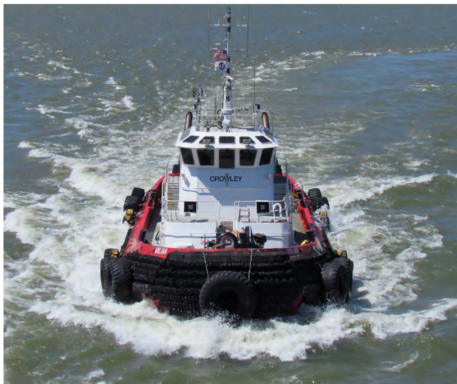
GOLIAH United States