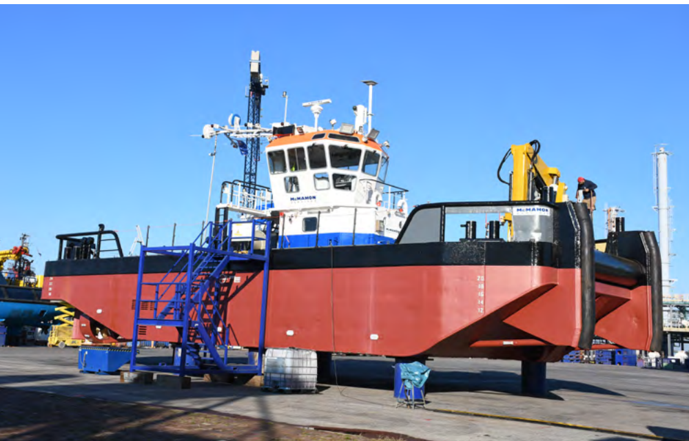
MC MAHON United Kingdom