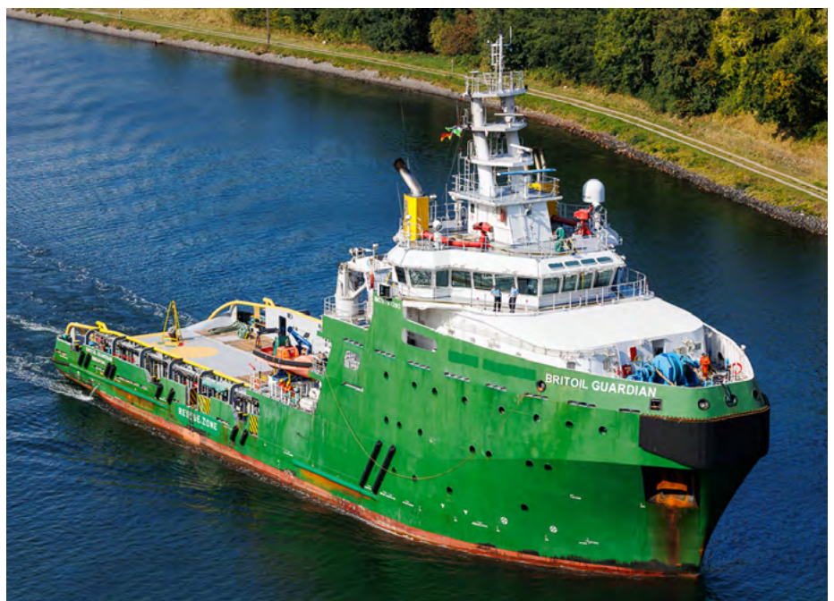
BRITOIL GUARDIAN Singapore