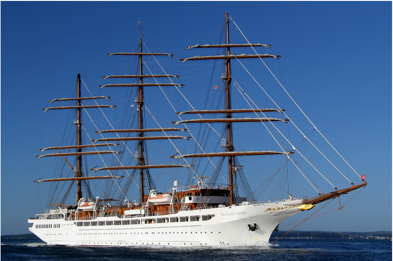
Sea Cloud Spirit

patrol, Poole Bay) : DR LAPWING 73/144 ex Lapwing PD.972 - 20, Defiance FR.385, Defiance FR.125, Xmas Rose FR.125 - xx {Ryde Roads [26] CD [26] Kilkeel) CHARLES ISLAND 93/14,061 (Vlissingen [29] AJQ}