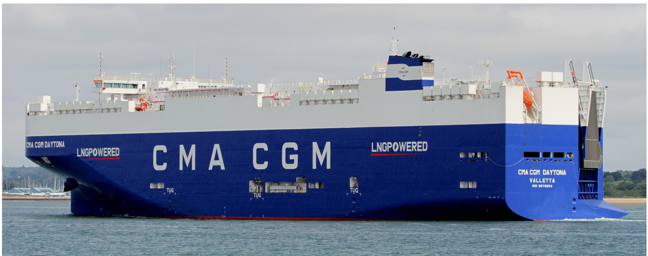
CMA CGM Daytona