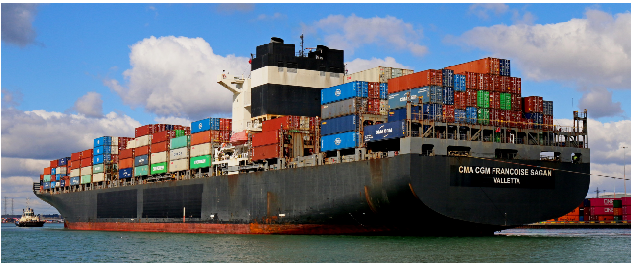
CMA CGM Francoise Sagan