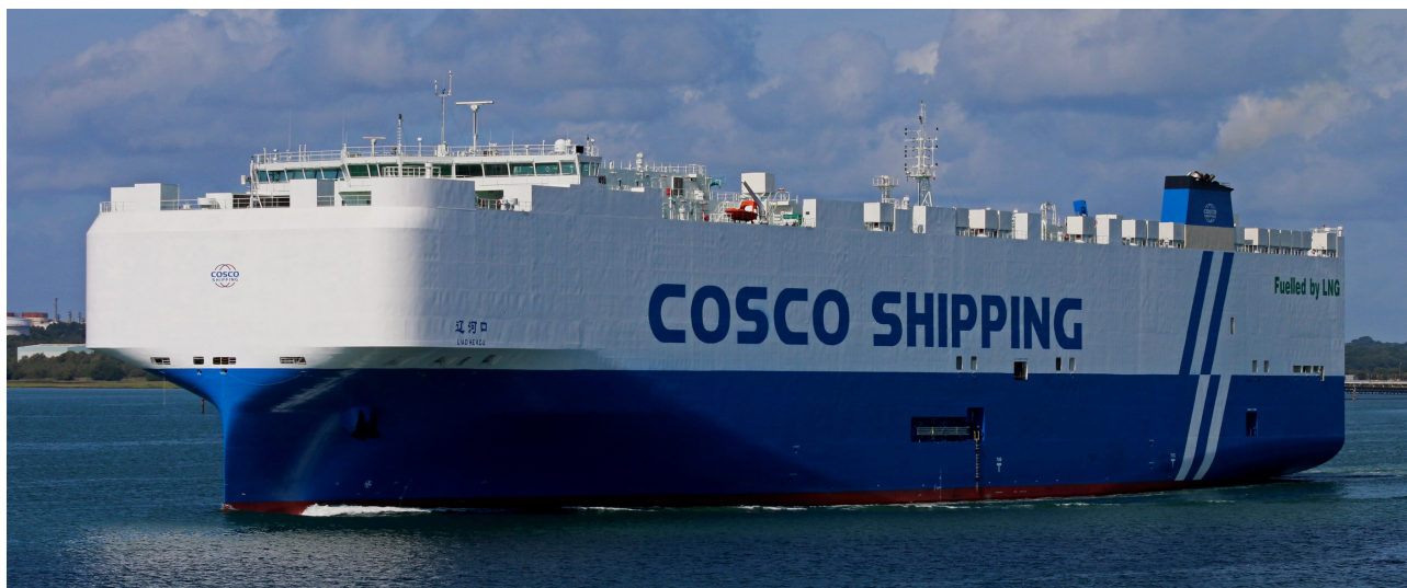
Liao He Kou