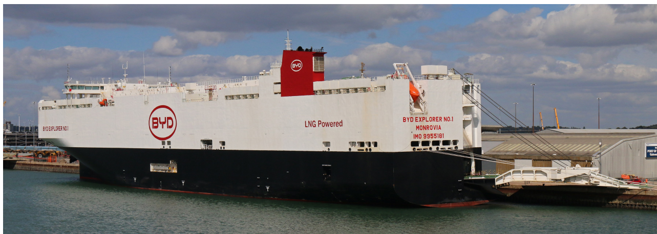
BYD Explorer No.1

Aida - 16 (Zeebrugge [25] 35 [26] Davisville) : GRANDE AMBURGO 03/57,000 (Limas [25] 101 [26] Antwerp) GRANDE EUROPA 98/51,714 (Valencia [27] 105 [28] Wallhamn) : BOHEME 99/67,264 (Antwerp [27] 38/9 [28] Bremerhaven) : MORNING LYNN 09/68,701 (Gothenburg [27] 35 [28] Halifax) : LIAO HE KOU 24/72,255 (Singapore [28] SGL3 [29] Le Havre) : BYD EXPLORER No.1 24/69,407 (Bremerhaven [28] NA(s) [29] 38/9 [29] Port Louis, Martitius) : SIRIUS HIGHWAY 75/75,044 (Davisville [29] 40/41 [30] Bremerhaven) : HEROIC LEADER 11/48767 (Zeebrugge [31] 31)