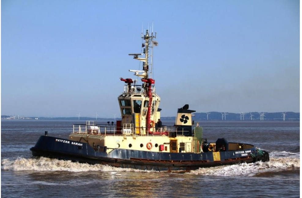
SVITZER SARAH at Eastham.

Two vessels have been added to Boluda's Liverpool fleet in the last seven months. The Chinese-built SERVICEMAN arrived from the Thames in Late July. Delivered for Lamnalco Sharjah as HAMRA in 2005 she was acquired by SMS Towage in 2016. The VB prefix was added to her name in the Autumn.