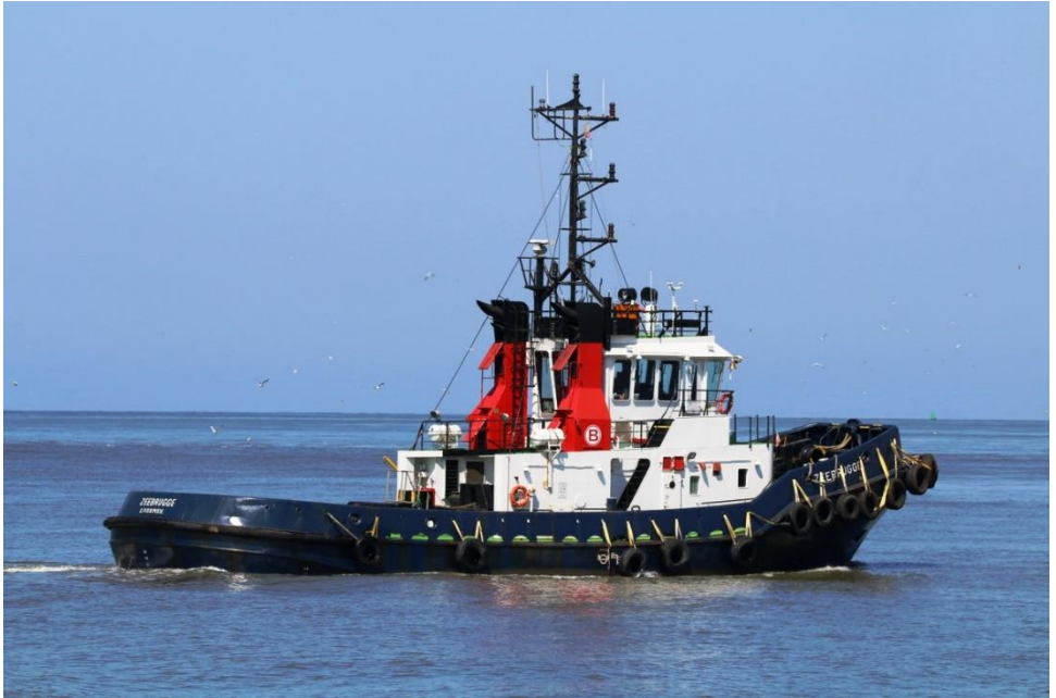
ZEEBRUGGE in the Mersey.

Svitzer have sold the Bromborough-built SVITZER SARAH to Portland-based Quest Marine Towage. Having reverted to LADY SARAH in November she sailed for Swansea in December. The third of eight sisters built by McTay Svitzer continue to operate the ALMA, CECILIA, JOSEPHINE, KATHLEEN and LYNDHURST. The lead vessel, ANYA, is now with Romanian operators as BSV FRANTA whilst the former TRAFALGAR is with Taiwan owners as YU FU No. 569.