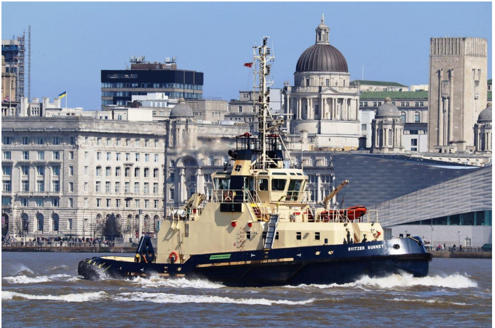
SVITZER SURREY in the Mersey.

The Merseyside Branch of the World Ship Society meets on the second Tuesday of each month – January excepted- at the Liverpool Seafarers' Centre, 20 Crosby Road South, Crosby, L22 1RQ