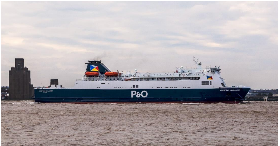
EUROPEAN HIGHLANDER leaving Cammell Laird, Birkenhead on 14 Feb 2025.

EUROPEAN HIGHLANDER departed Cammell Laird on 14 Feb after her refit and made her way back to Larne where she resumed service on the North Channel route to Cairnryan.