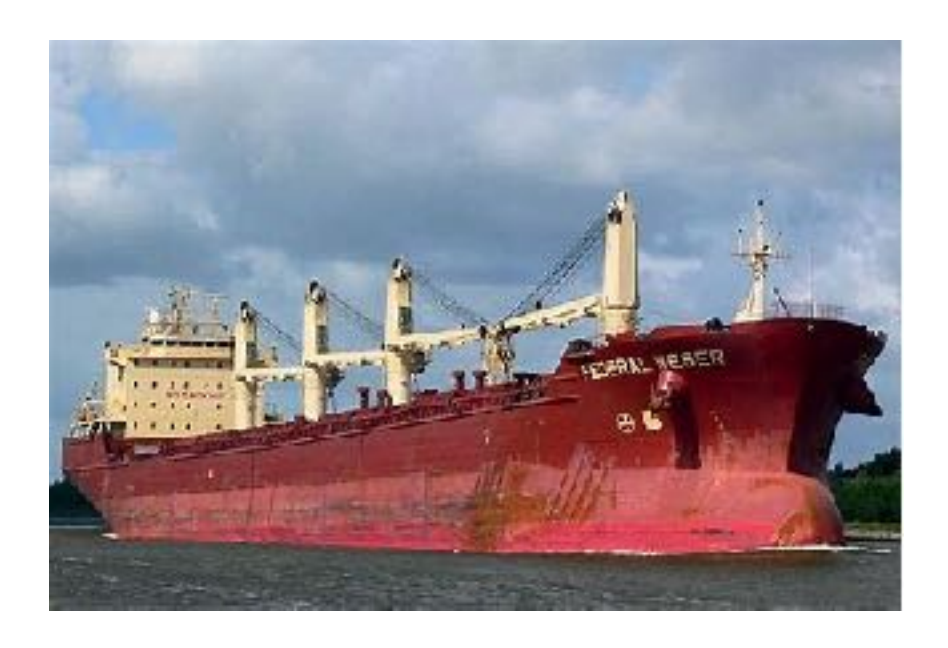
2006 Umiak I delivered as the highest ice class cargo vessel in the world

A purpose-built ice-strengthened bulk carrier constructed for the Voisey's Bay Nickel Company, a wholly owned subsidiary of Vale, to transport ore from the Voisey's Bay Mine.