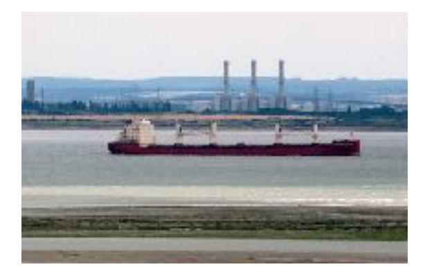
Federal Alster Federal Asahi

owned and long-term chartered fleet is over 4,100,000 mt, with an average age of about 8 years \,