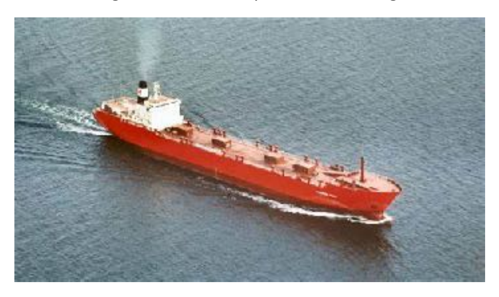
1973 Delivery of two ro-ros the Avon Forest and Federal Avalon 1978 MV Arctic built

1972 Laurentian Forest is delivered Fednav transports its first cargo of Australian sugar . Busiest Arctic year with 14 sailings