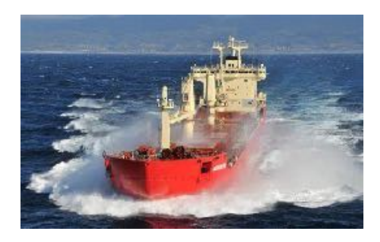
2019 Federal Kumano launches 60th anniversary celebrations

In 2023, Fednav sold both Federal Marine Terminals, Inc. (FMT), to focus on shipping.